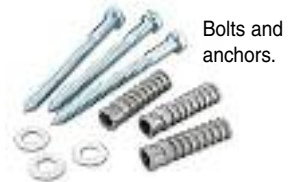
Bolts and anchors.

To attach the gate/railing to the post/pillar use the typically provided mounting hardware or commonly used masonry/concrete anchor bolts such as wedge or lag - both are found at any big box or local hardware store. Start by carefully positioning your bottom hinge or bracket and mark the location where the holes will be drilled. It is important to place the bottom bracket for a railing at the proper height and that's level, and for a hinge, so it allows a gate to swing unimpeded.